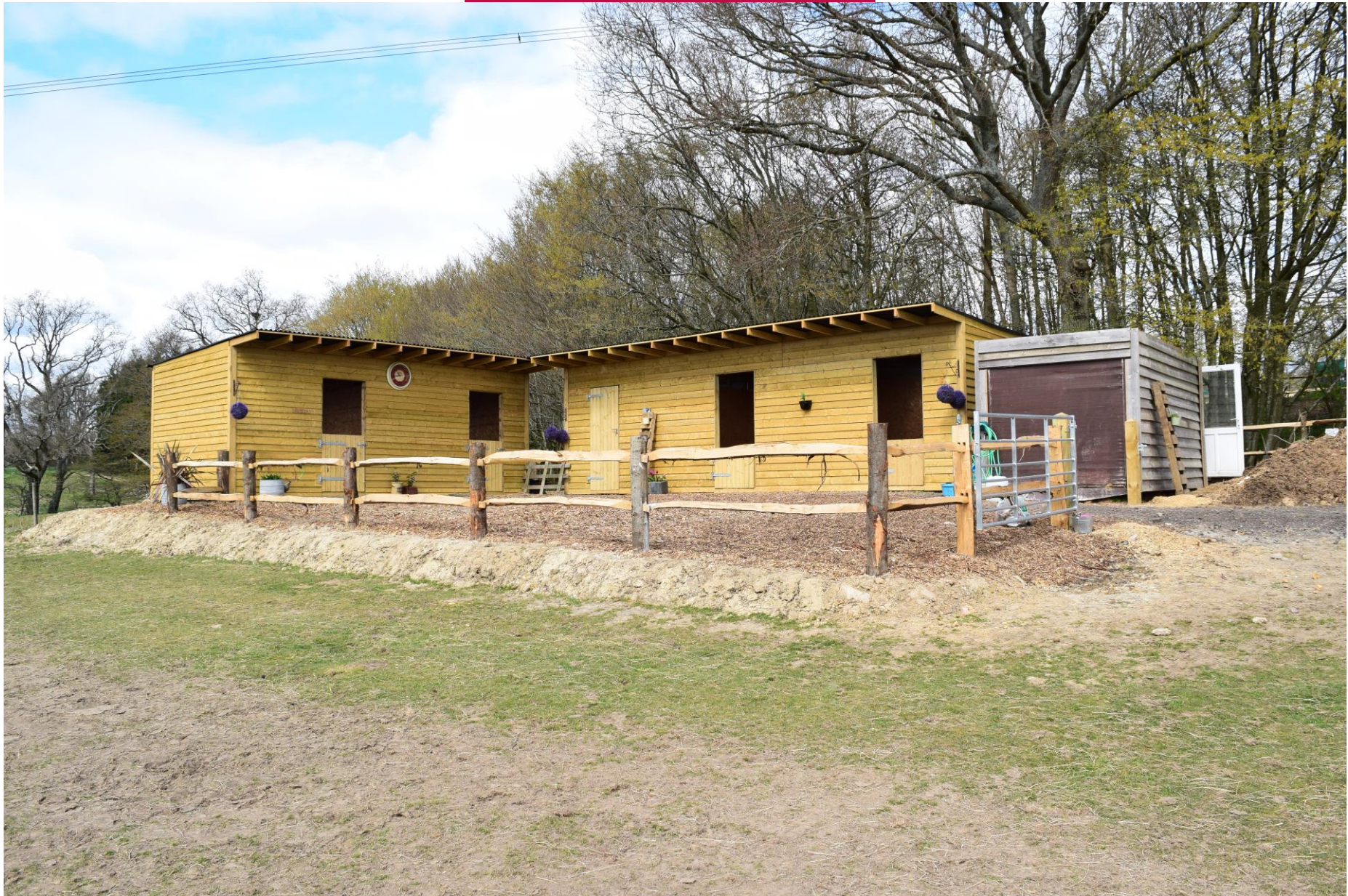
Blackmores Paddock Seddlescombe, Battle